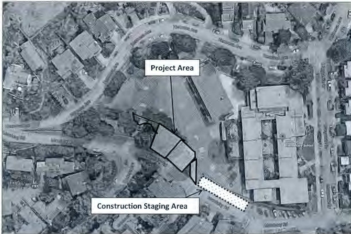
Figure 2: Project Site and Surroundings—Hillcrest School