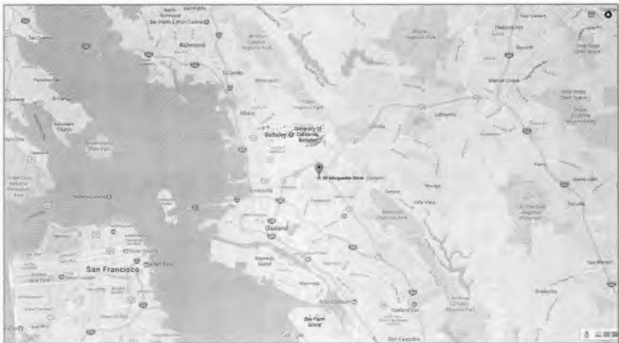
Figure 1: Regional Location

Construction activities are anticipated to occur for a total of 245 active days, spanning approximately 12 months, from latter part of 2018 to 2019. Construction would occur in a single phase. Construction activities would consist of limited excavation and grading, foundation construction, construction of the building and finishing interiors, and roadway and parking lot finishing. Typical equipment used during construction would include an excavator, skid-steer loader, backhoe, trencher, crane, rough terrain forklift, paver, and paving equipment. Staging would primarily occur within the Project site near the entry gate at Mandalay Rd and Wilding Lane, except in certain instances, such as deliveries or removal of large quantities of material, when parking lanes on one or more of the street frontages may be temporarily closed. During construction approximately 10 of the existing parking stalls will be temporarily fenced off to use for staging materials, equipment and contractor's trailer office.