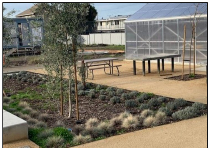
Garden and Greenhouse