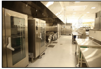
The Center (Central Kitchen)