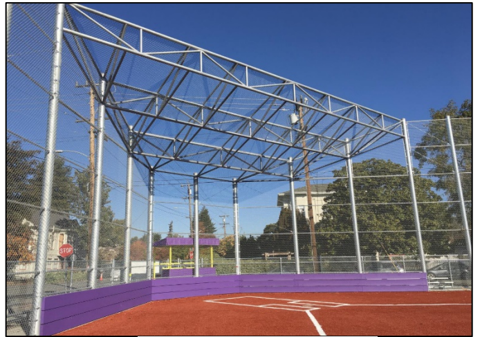
Homeplate and Overhead Screen