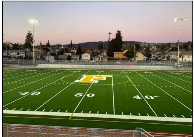
Football and Soccer Field