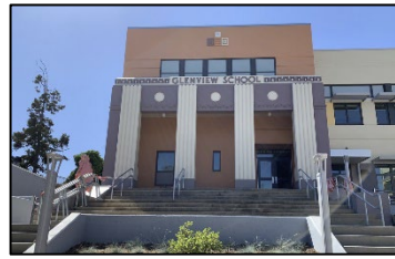
Glenview Elementary School