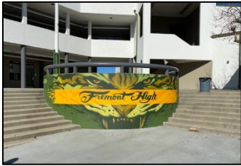
Fremont High School

Although most OUSD facilities were closed due to the pandemic during the school year, OUSD completed construction on several Measure J bond related projects (see Project Photos on page 7):