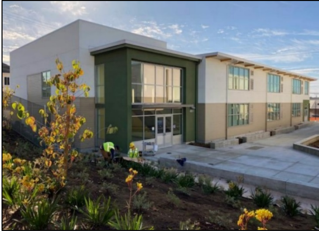
Fremont High School