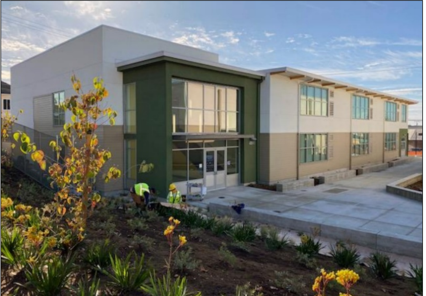
Fremont High School – New construction completed with Measure J bond funds