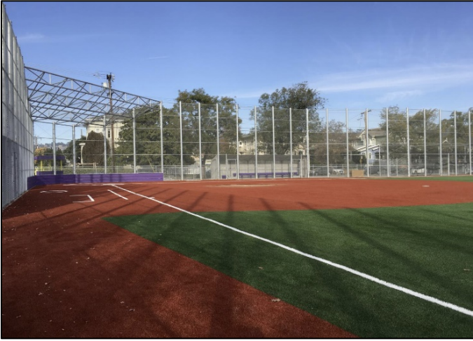
Infield and Homeplate