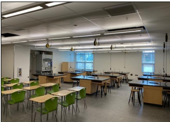
Science Lab Classroom