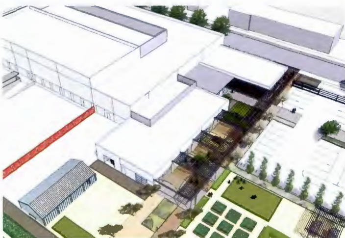
Concept Building Model

The Schematic Design phase is complete. Construction Documents are now in production. A revised cost estimate is due at 50% completion of the Construction Documents.