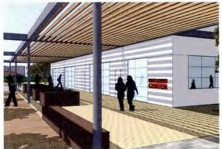
Concept Canopy Model