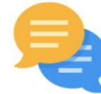
ENGAGEMENT / COMMUNICATION