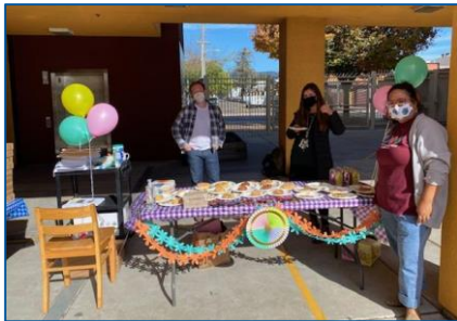
TCN Admin team ready to celebrate their teachers and hand out the new devices.