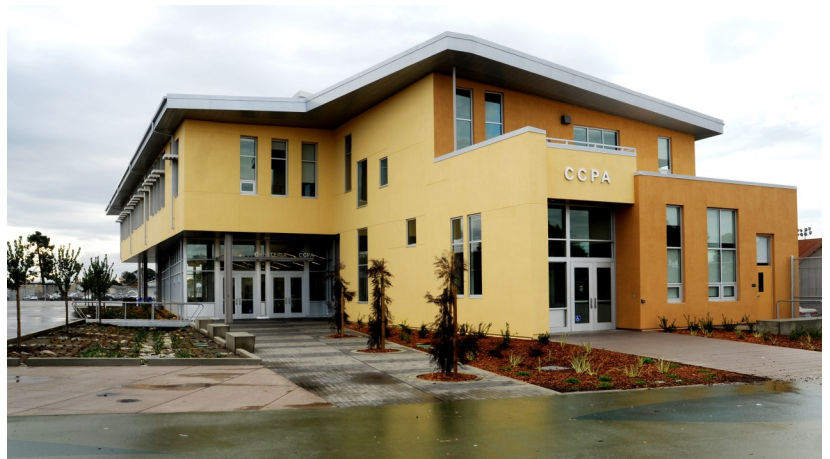
Roots International Academy and Coliseum College Prep Academy at Havenscourt New Classroom & Cafeteria