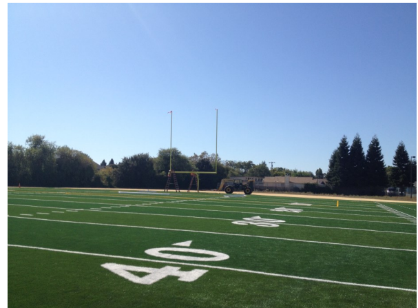
Madison Park Upper Campus School Athletic Field

Part of the District's goal to support every aspect of student need, includes new child development centers (CDC) and school-based health centers (SBHCs) at some school sites. These facilities provide essential support services to students and the community at-large. Currently, OUSD has developed 31 CDC's and 14 SBHCs using Measure B funds. The photos show a few sites where OUSD has developed SBHCs during the past year.