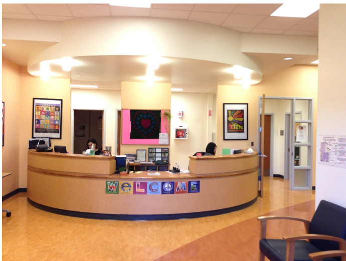
La Escuelita Wellness Center

Modernization of the existing Child Development Center at Arroyo Viejo includes a complete renovation of the building and grounds. The building has 4 classroom spaces and is approximately 5,000 square feet. A variety of shading devices and structures are installed around the perimeter of the building. The interior and exterior of the building has been re-clad with new materials. The floor plan has been reconfigured to better suit the programmatic needs of the CDC.