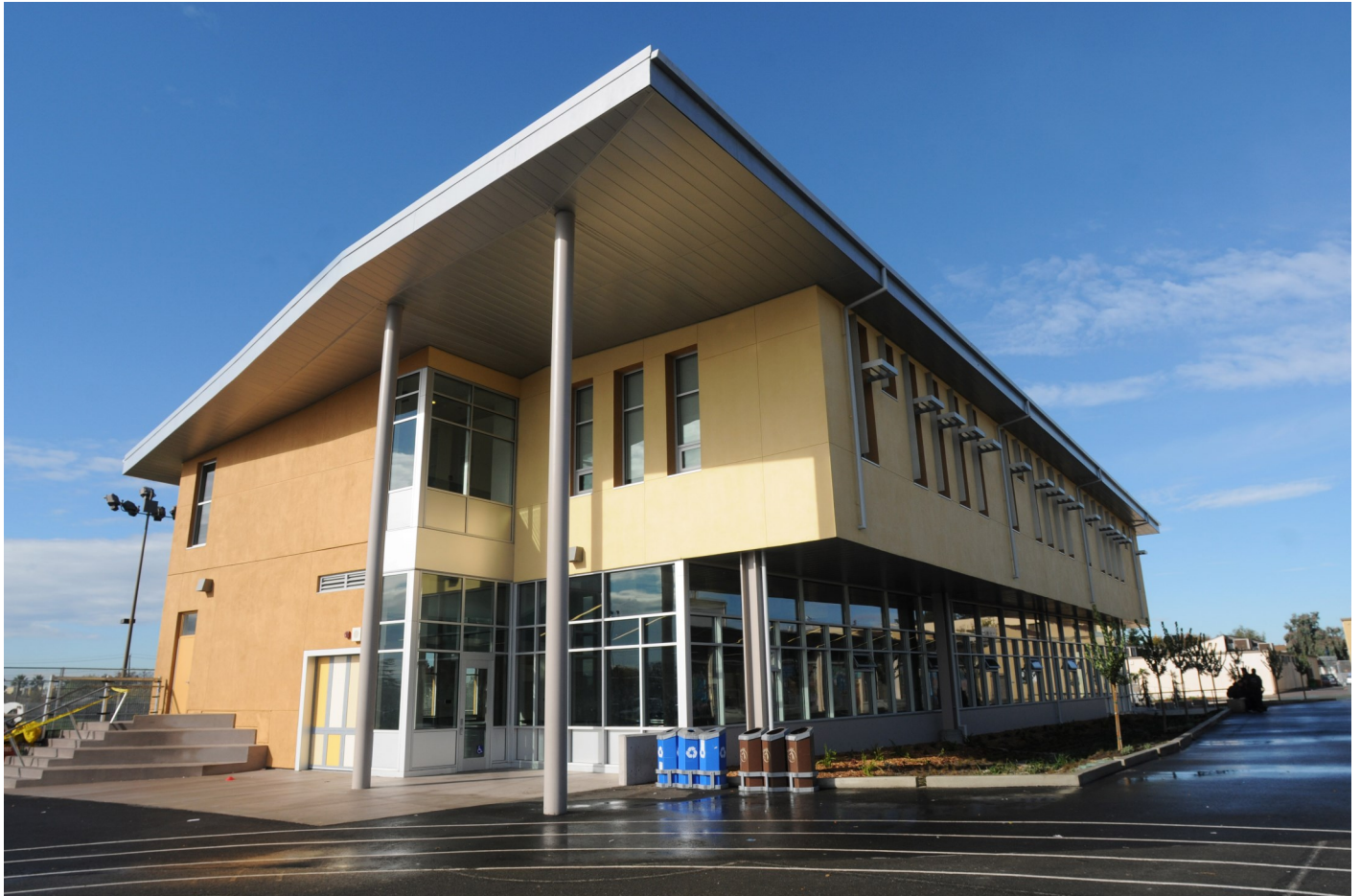
Coliseum College Prep Academy and Roots International Academy at Havenscourt New Classroom & Cafeteria Building

Measure B Independent Citizens' Bond Oversight Committee