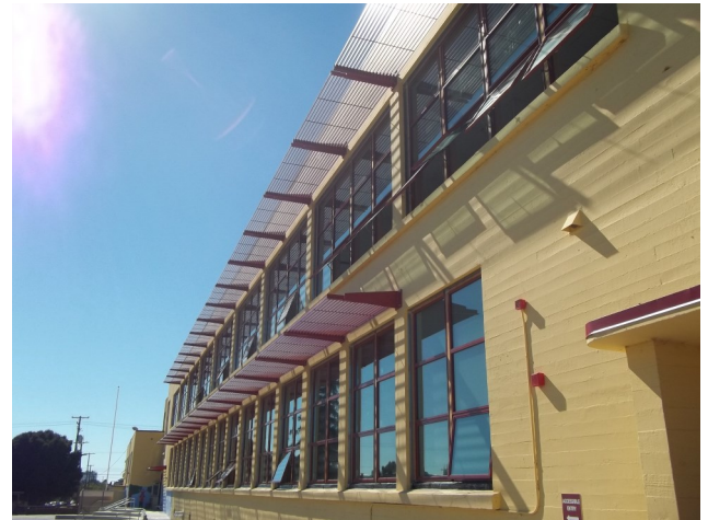
Sankofa Academy at Washington Modernization