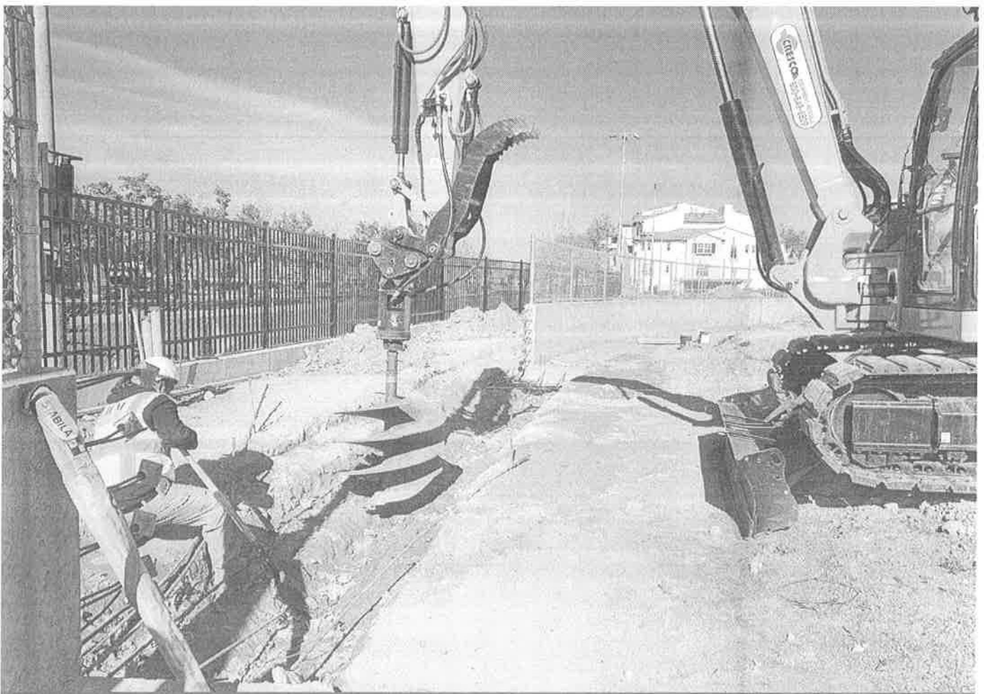
Dublin Unified School District, Emerald High School