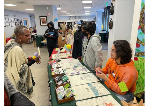
Oakland High VAAMP students discussing their artwork with customers at the Winter Artist Market at MOCHA, 2023