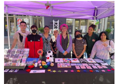
Photos from Youth Creative Expo, 2023