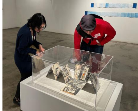
Career Technical Education; Arts, Media & Entertainment Professional Development at KALA Art Institute, November 2023