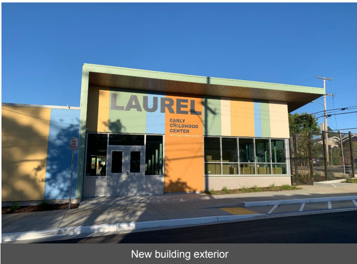
New building exterior

There is nothing to report at this time.