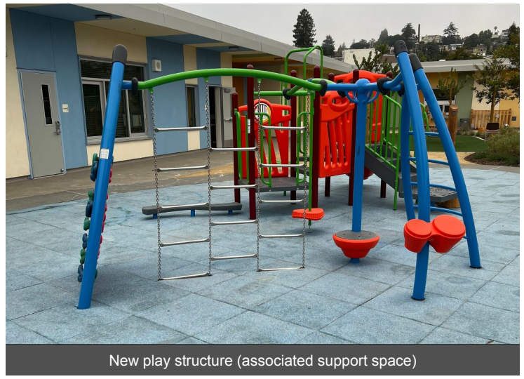
New play structure (associated support space)