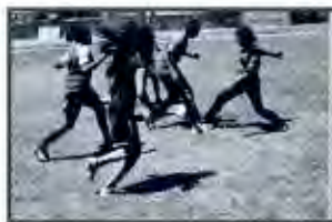
The U-19 Girls Team practicing at Oakland International High School, 2009