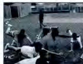
Members of the U-14 Team Stretching at Practice, 2011