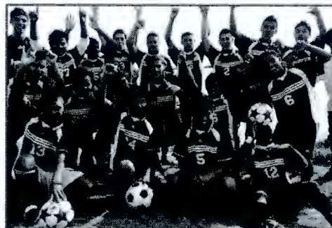
The U-19 Boys Team after a game, 2010