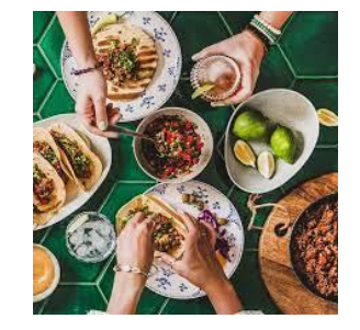
a special meal for a SELLS meeting or engagement!

The three schools with the highest percentage of families of English Language Learners that fill out the survey win: