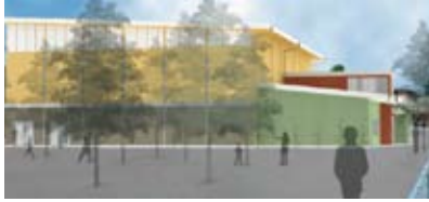
Rendering of Urban Promise Academy (East)