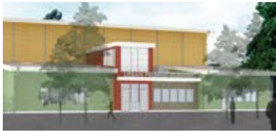
Rendering of Urban Promise Academy (South)