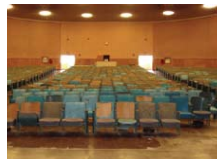
Castlemont High School Auditorium BEFORE