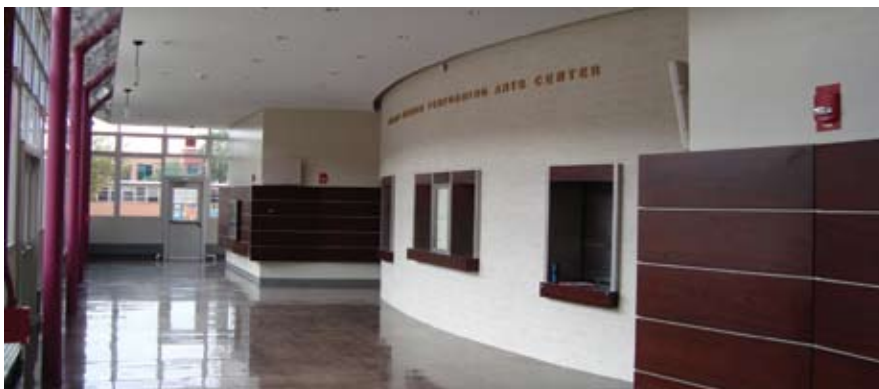
New Castlemont High School Performing Arts Center