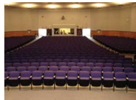
Castlemont High School Auditorium AFTER