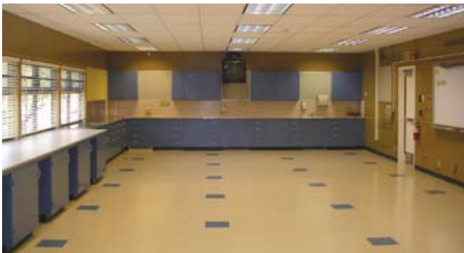
Classroom Lab, Madison Middle School