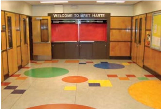
Bret Harte Hallway