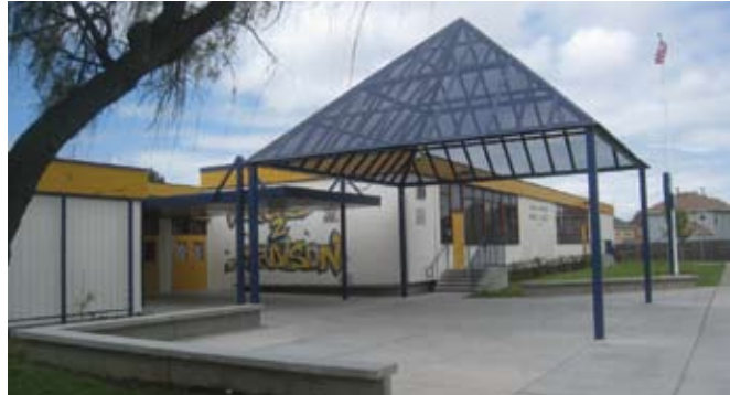
Madison Middle School Exterior