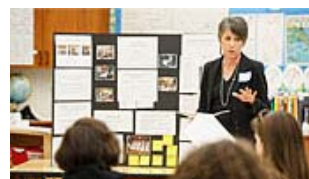
Mills prepares students to improve teaching and learning in our communities.