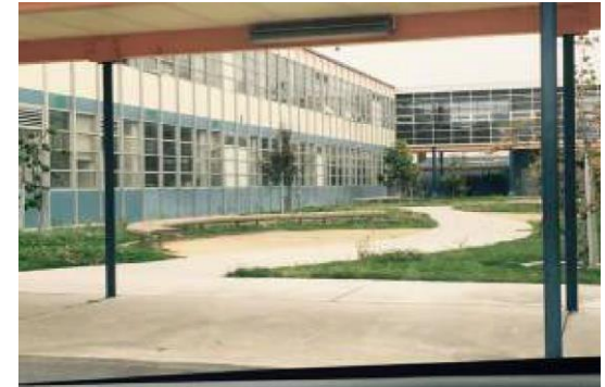
West Oakland Middle School Courtyard