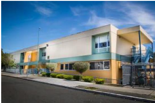
Laurel Elementary School Exterior