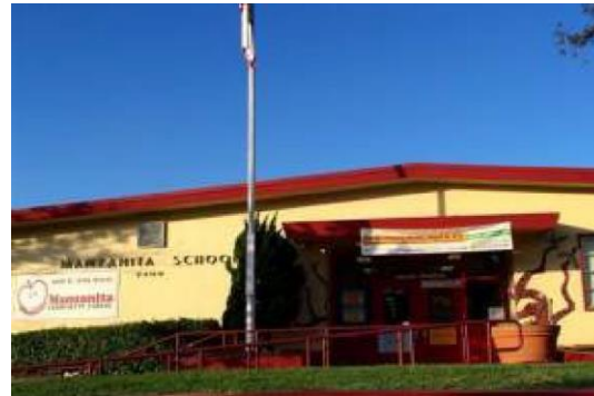
Manzanita Community School Exterior