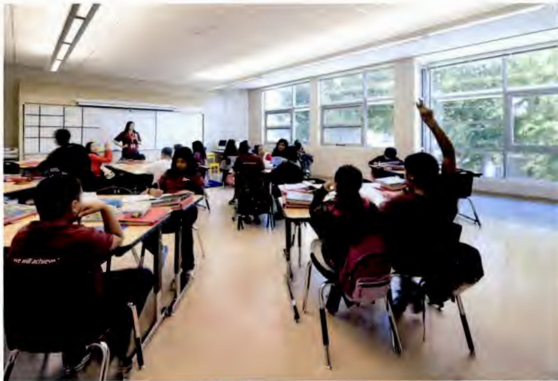
Jefferson ES New Classroom