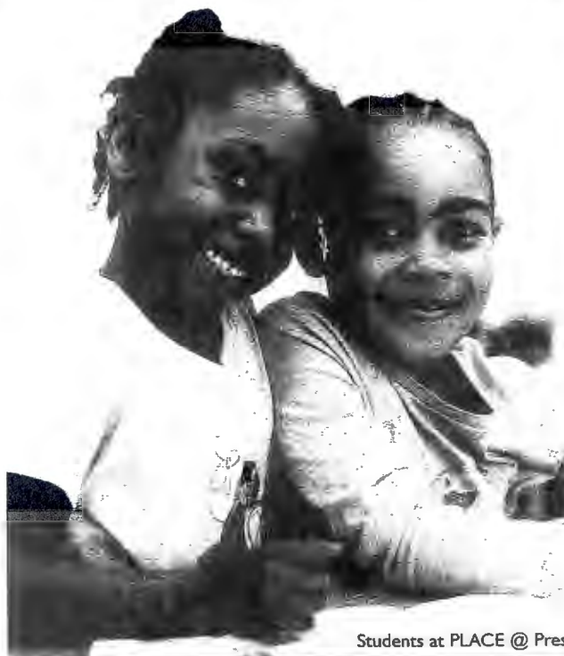
Students at PLACE @ Pres

The Oakland Schools Foundation is a local education fund that secures and manages resources for Oakland public schools in order to support its vision of equity; that all students have the opportunity to achieve excellence.