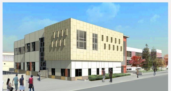
Future Two Story Classroom Building