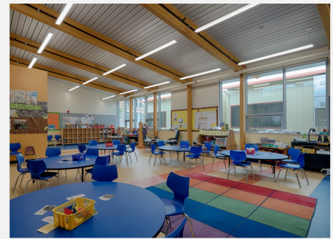
Greenleaf Kinder Campus Classroom

Students and the greater community have enjoyed use of the field and the surrounding track at Skyline High School since 2002. Over time, frequent use of the turf and track have required its replacement. In Summer 2015, the existing turf was removed and a new synthetic turf athletic field was installed. The track was resurfaced and the existing drainage system was flushed out. An access road with new concrete v-ditches was also replaced.