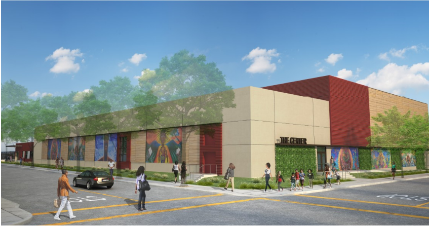
The Center: Central Kitchen and Education Center*