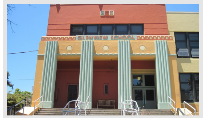
Existing Glenview Elementary Front Entrance Façade