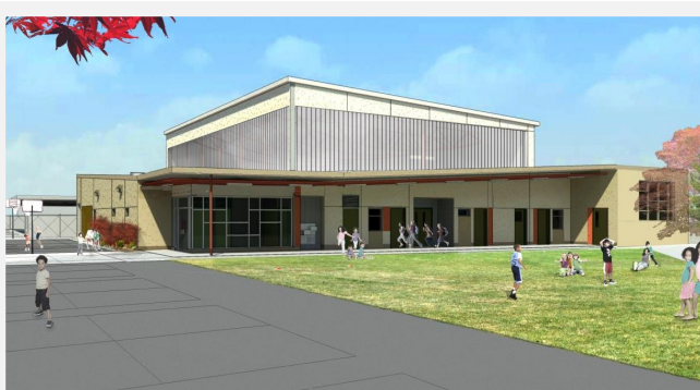
Future Multipurpose Building

Phase 2 of the grade expansion of Greenleaf Elementary School from K-5 to K-8 is construction of a new 14,646 square foot two story classroom building and a new 9,600 square foot multipurpose and flex classroom building. The new classroom building will be a high performance building featuring good lighting, clean air, and comfortable classrooms to create healthy learning environments for students. It will house offices and a library.