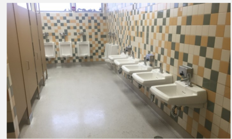
Sobrante Park Restroom Renovation