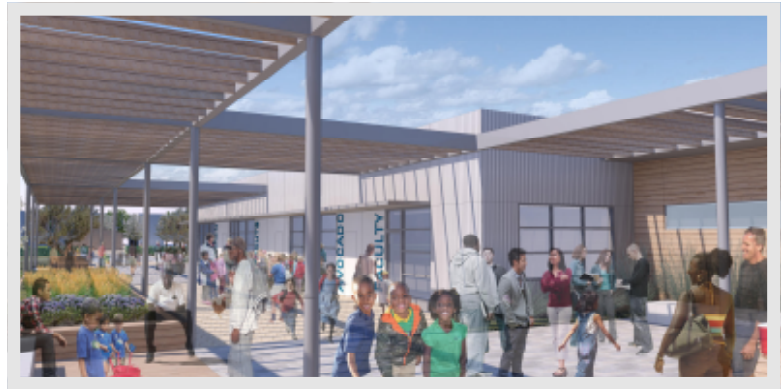
Foster Central Commissary Rendering Indoor and Outdoor Spaces Invite Students to Learn

As part of the Foster Central Commissary model the finishing kitchens are designed to prepare meals from bulk ingredients delivered by the new Central Commissary. Currently each existing kitchen serves pre-packaged hot food delivered to the school. This new design will allow students the opportunity to have fresh prepared meals onsite. The project includes a fully equipped kitchen addition (970 SF) containing a servicing line, cooking oven, dry goods storage, tray wash area, food preparation area, staff restroom and custodial closet. Hot food will be prepared, cooked and served in the new kitchen and includes a full-service salad bar, fresh fruit, milk coolers and a hydration station.