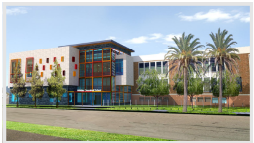
Whittier ES Expansion Project Rendering

The expansion project at Whittier includes construction of a new two-story addition, a multipurpose building, a flex classroom building and four new modular kindergarten rooms. The existing three level classroom building will include seismic improvements and upgrades to the heating system, plumbing, lighting and interior finishes.