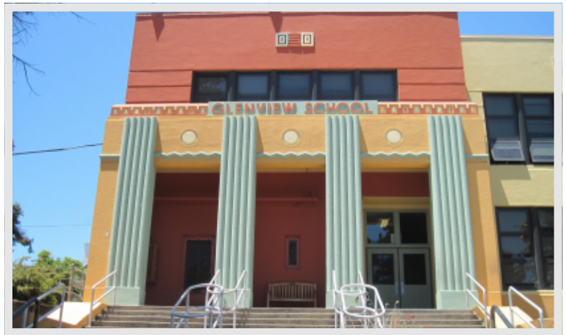
Existing Glenview Elementary Front Entrance Façade to be Retained

The Glenview Elementary School New Construction project scope includes a new 52,000 SF two-story building with a partial basement that will replace the existing structures. The new building will include a lobby, administrative and student support offices and meeting rooms, a library and a multi-use room with a stage, kitchen and storage. The new building will be constructed to be designed to be grid neutral incorporating rooftop PV panels. The existing two story facade section and porch feature which is to be retained will be incorporated into the new building structure and related site work improvements.