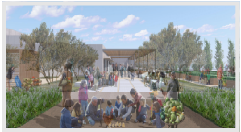
Foster Central Commissary Rendering View of Urban Farm Looking Back to Education Center