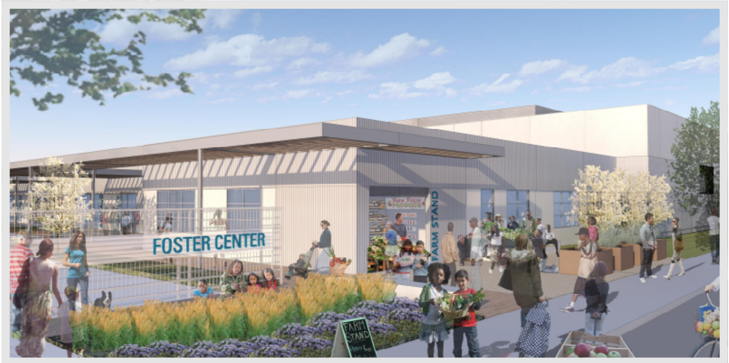
Central Commissary at Foster Project Rendering