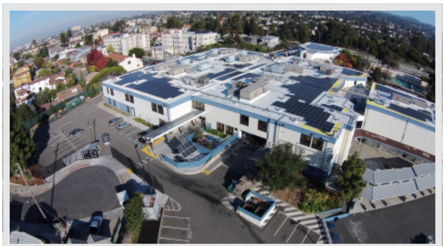
Oakland High School CSI Project