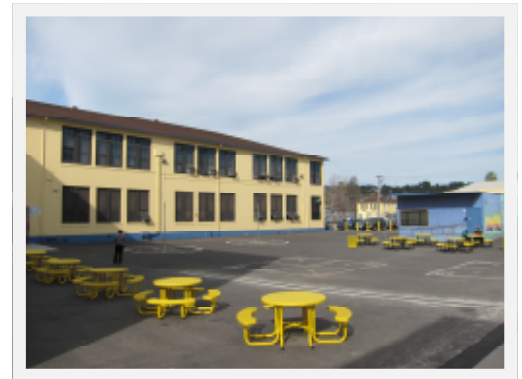
Elmhurst MS Paving Project

The Elmhurst Paving project included replacement of existing asphalt at parking lots and playgrounds including new striping for parking lots, playgrounds and the basketball court.