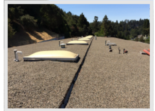
Thornhill ES Roofing Replacement Project

The roofing projects completed this past summer included roof repairs at Rudsdale, Thornhill and Melrose Elementary. Work included removal of existing gutters, downspouts through-out, including replacing the ductwork for the existing HVAC systems and related electrical conduits on the new roofs.