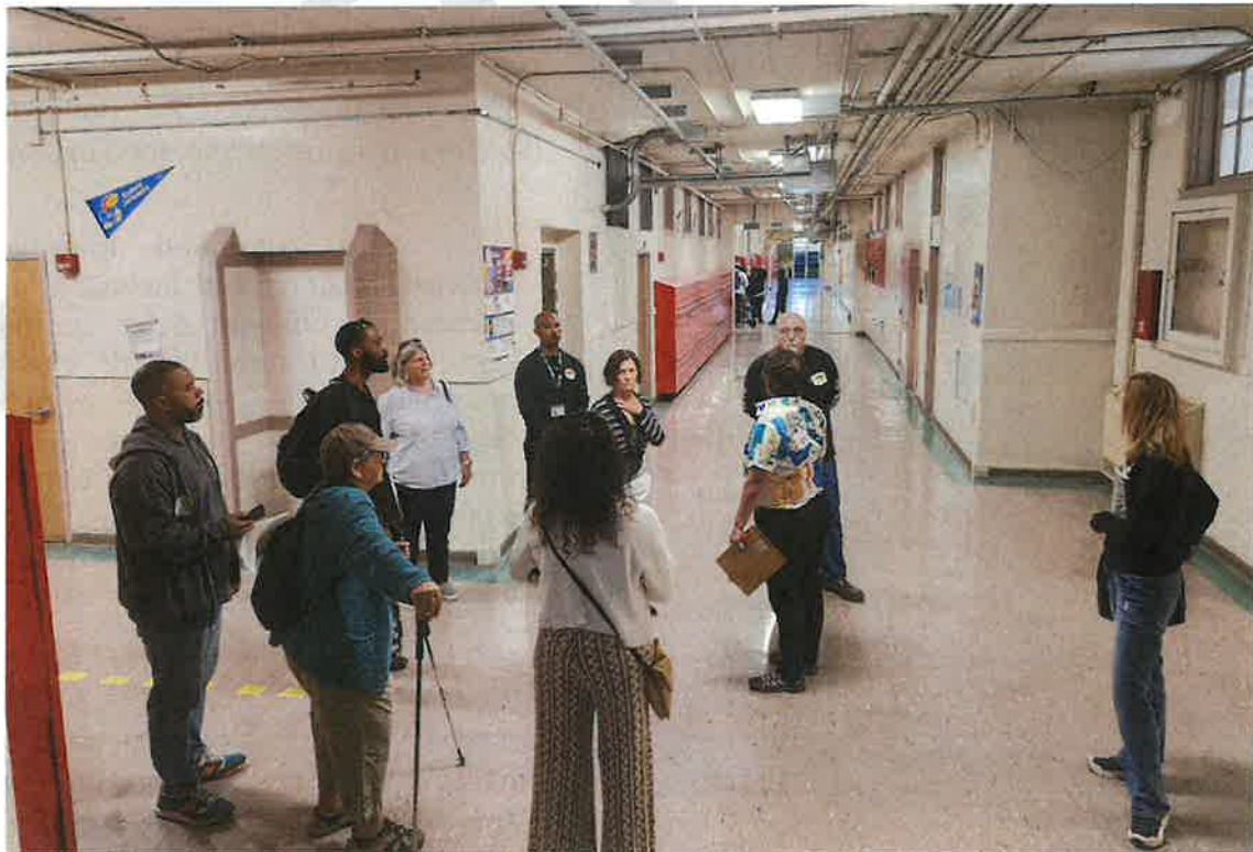
Above: CBOC Members and others During a Site Visit to Roosevelt Middle School