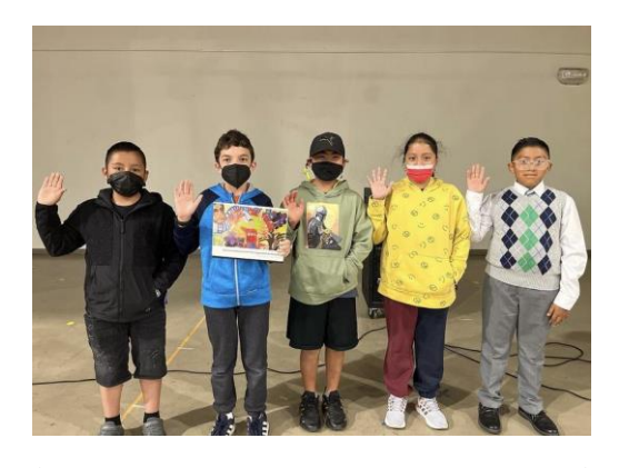
(TCN student council members above)