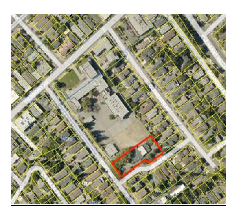
Exhibit A (Depiction of the Property and the Premises)