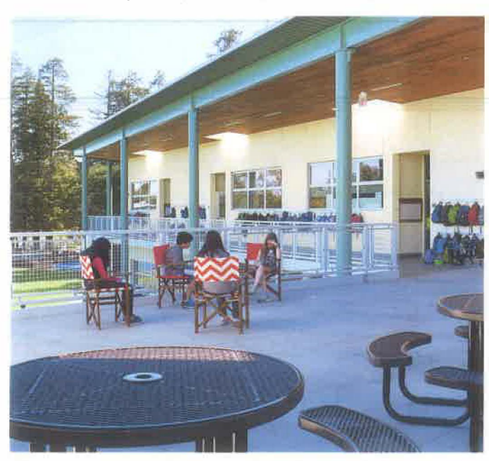
Fairmeadow Elementary School, Palo Alto Unified School District