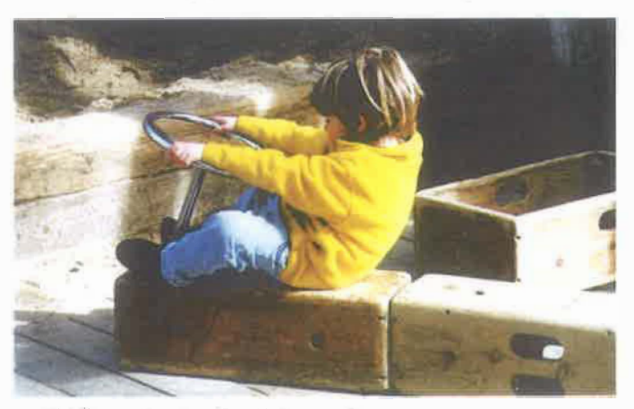
Laurel Hill Nursery School Play Yard San Francisco