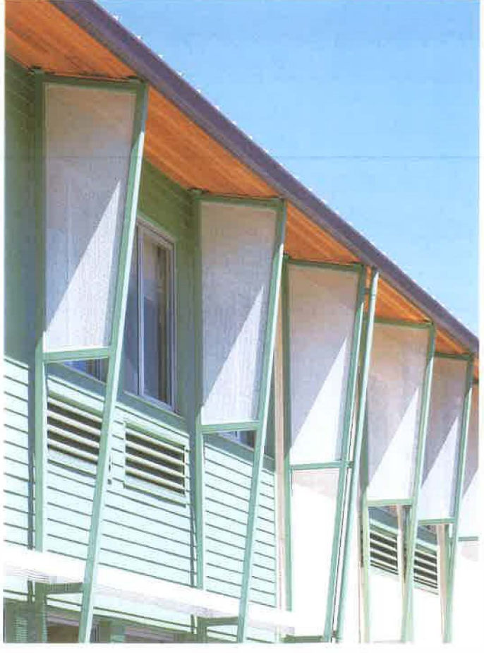
Ohlone Elementary School, Palo Alto Unified School District

See following page for detailed schedule