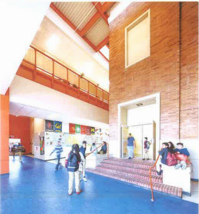
Greenleaf TK-8 School CASH/AiA California Honor Award OUSD