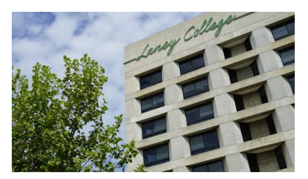
Laney College Locker Room Relocatable