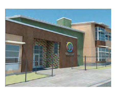
Jefferson Elementary School View #1

The Facilities Master Plan approved in 2006 as part of the Measure B process identified approximately $900 million of need to fully repair, replace and modernize the District's school facilities. To augment the $435 million Bond, the District has sought federal and state matching program funds. As of June 2010, the District had identified potential matching funds of about $55 million.