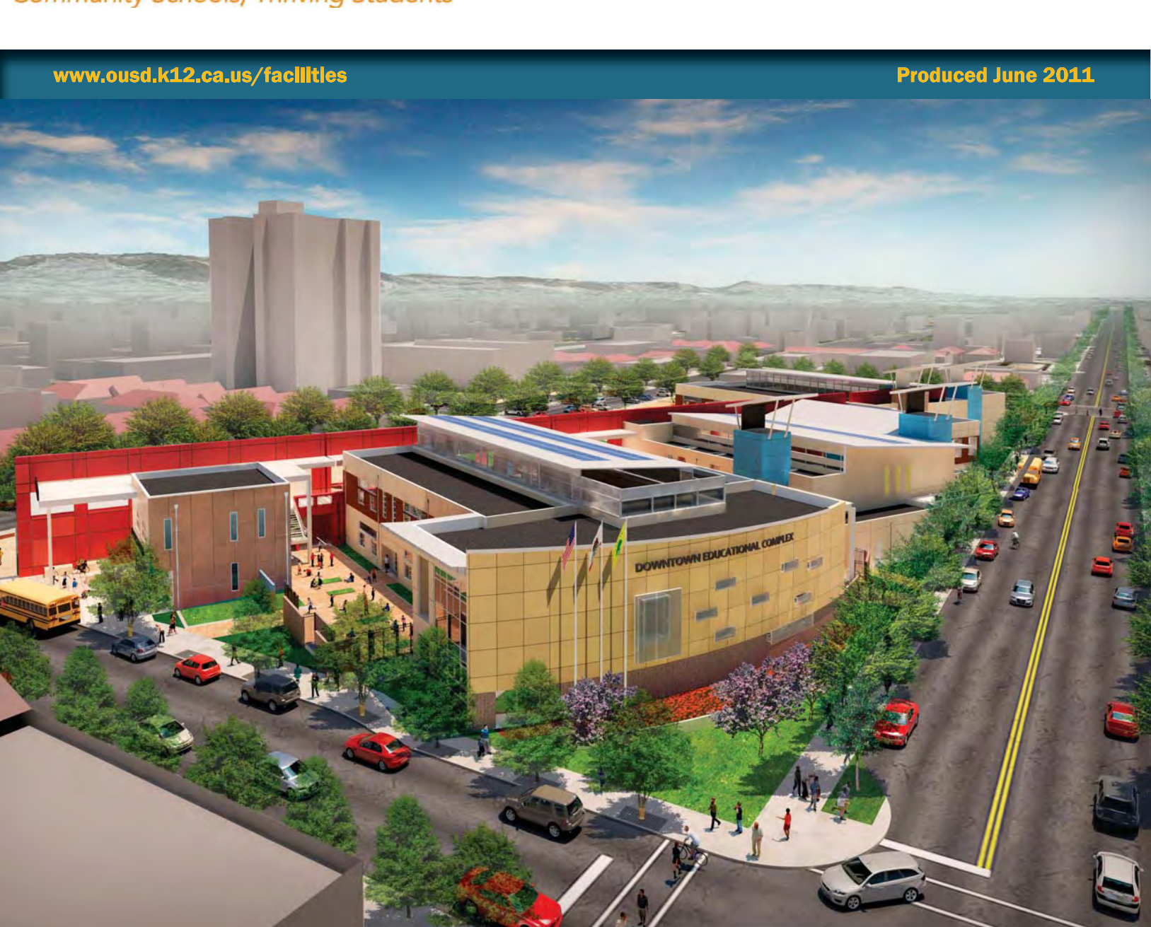
Artist's Rendering - Construction to Begin Summer 2011