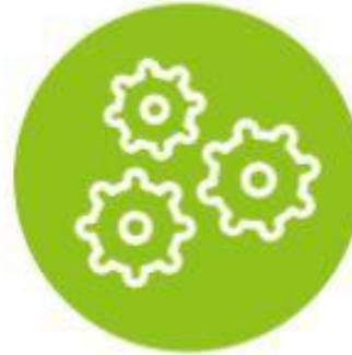
Operations and Governance